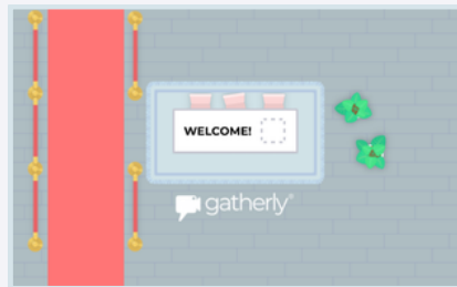
Lobby and Check-in