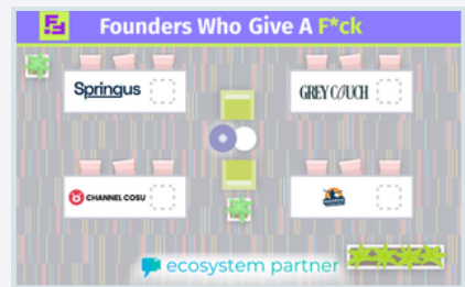
Expo Hall 4