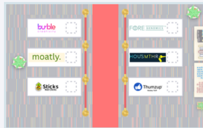
Expo Hall 1