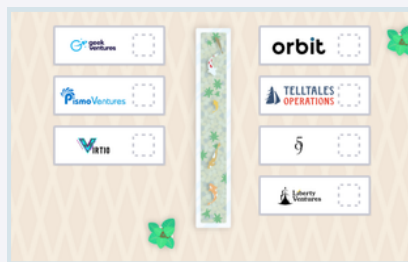
Event Sponsors & Partners