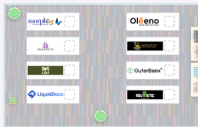
Expo Hall 3