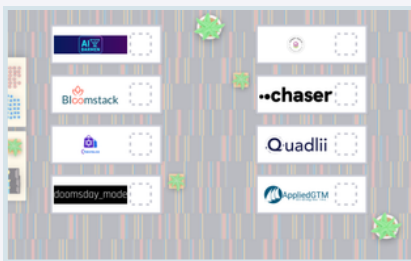
Expo Hall 2