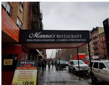
Manna's Soul Food