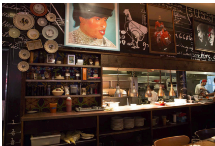
Red Rooster Harlem