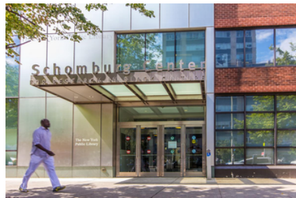
Schomburg Center for Research in Black Culture