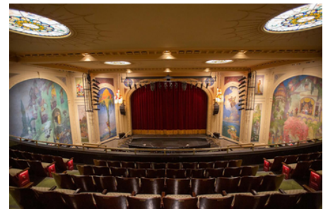
El Museo del Barrio