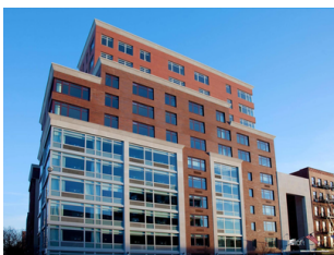
Aloft Harlem Hotel