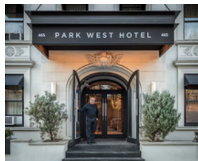
Park West Hotel