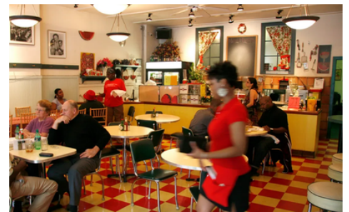
Miss Mamie's Spoonbread Too