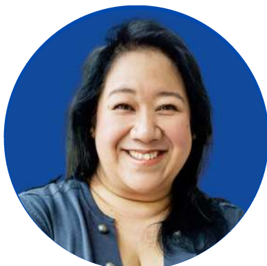
SANDY SUN Compass