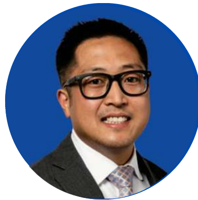
ERWIN PARK Madison Bay Commercial Ori Residential